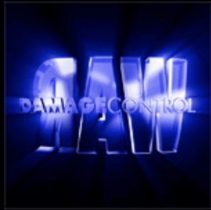
Damage Control - RAW