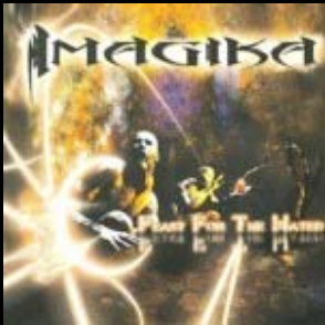
Imagika - FEAST FOR THE HATED