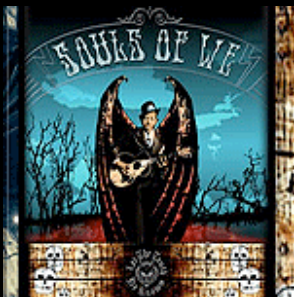
Souls Of We - LET THE TRUTH BE KNOWN