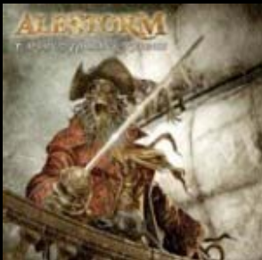
Alestorm - CAPTAIN'S MORGAN REVENGE