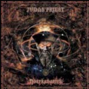
Judas Priest - NOSTRADAMUS