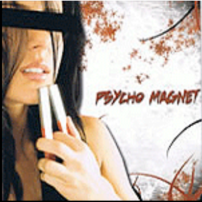
Bombay Black - PSYCHO MAGNET