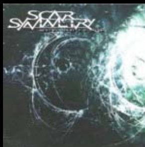
Scar Symmetry - HOLOGRAPHIC UNIVERSE