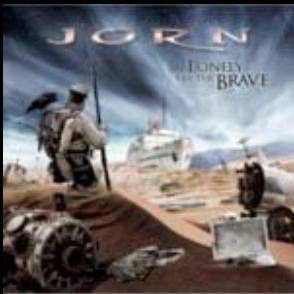
Jorn - LONELY ARE THE BRAVE