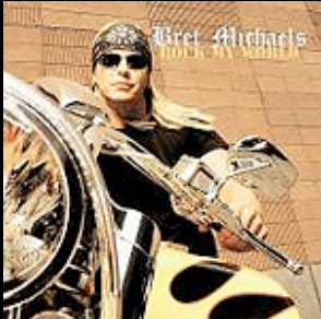
Bret Michaels - ROCK MY WORLD