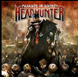
Headhunter - PARASITE OF SOCIETY