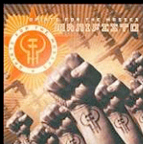
Opiate For The Masses - MANIFESTO