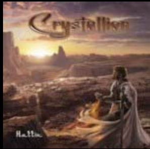
Crystallion - HATTIN