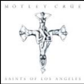
Motley Crue - THE SAINTS OF LOS ANGELES