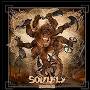
Soufly - CONQUER