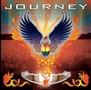
Journey - REVELATION