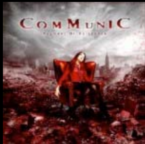
Communic - PAYMENT OF EXISTENCE